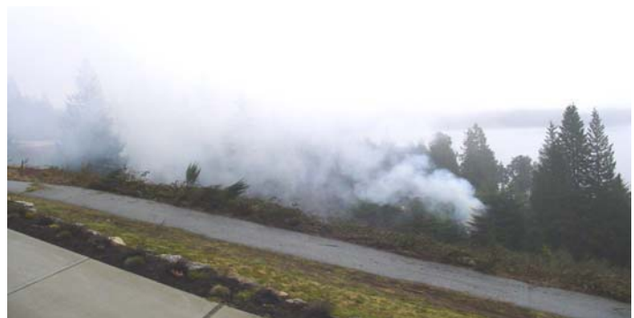
ACRID SMOKE DRIFTS UP from a nearby backyard burn in a Hopkins Landing residential neighbourhood .

We became aware that the Town of Gibsons and the Municipality of Sechelt had moved forward to ban